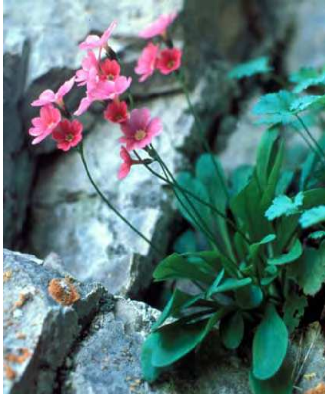
Used with permission.

U.S. Fish and Wildlife Service Utah Field Office - Ecological Services West Valley City, Utah 84119