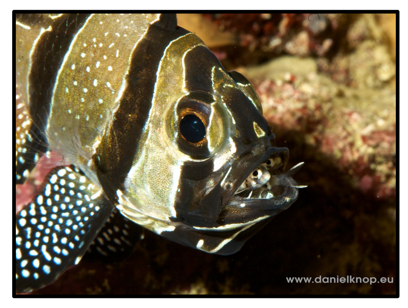
Figure 1. Parental care in male Banggai cardinalfish with juveniles in the mouth cavity.

personal communication 2014), of which less than 5% may survive to adulthood (Vagelli 2007 as cited in CITES 2007). High mortality occurs during the first days after release from the brood pouch due to predation, including parental and non-parental cannibalism (Vagelli 1999). New recruit and juvenile survival is negatively correlated with adult density, most likely due to increased levels of cannibalism (Ndobe et al. 2013) and availability of microhabitat (Moore et al. 2012).