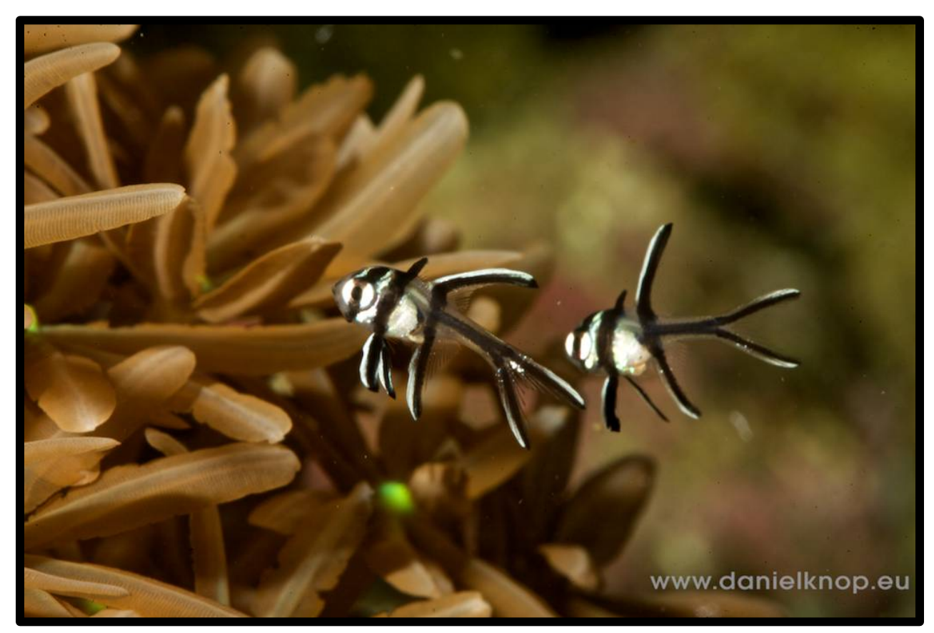
Figure 3. Banggai cardinalfish new recruits associated with sea anemones shortly after expulsion from male brood patch.

The sea urchin, Diadema setosum , is a natural component of the coral reefs within the Banggai Archipelago, and cardinalfish have always associated with this microhabitat as evidenced by the names for the Banggai cardinalfish in the two main local languages, which are loosely translated as 'little sea urchin fish' (Moore, STPL, personal communication 2014). However, Diadema setosum becomes prominent in degraded coral reef habitat, and anecdotal observations of the Banggai cardinalfish indicate it may be able to survive in degraded habitat by seeking refuge among these urchins (Lilley 2008). In the absence of a healthy coral reef, the Banggai cardinalfish also will associate with large objects, including wood, walls of piers, and rubbish (Lilley 2008). However, the extent to which the cardinalfish can survive or adapt, if any, to degraded habitat is unknown.